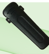
SDP700 Series belt clip 7A0BB000Z00