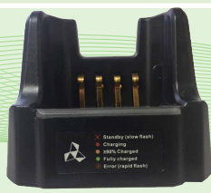
SDP700 Series single way charger including power lead 7A0BC00SZC1-B1